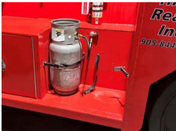
Very Low Lift LP Tank Loading. Improves safety immensely.