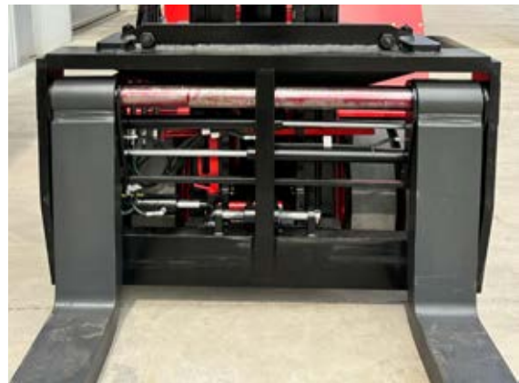
Easy-to-Use power fork locators for supporting different sized loads.