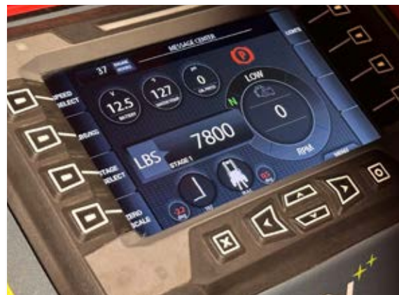
State-of-the-art electronic easy-read load scale.