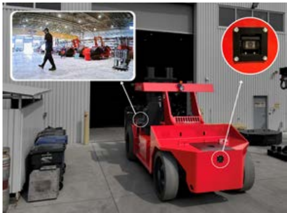
Back up camera, back up alarm, among the safety features standard.